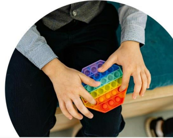
3 - Sensory Hour - Brighton Library