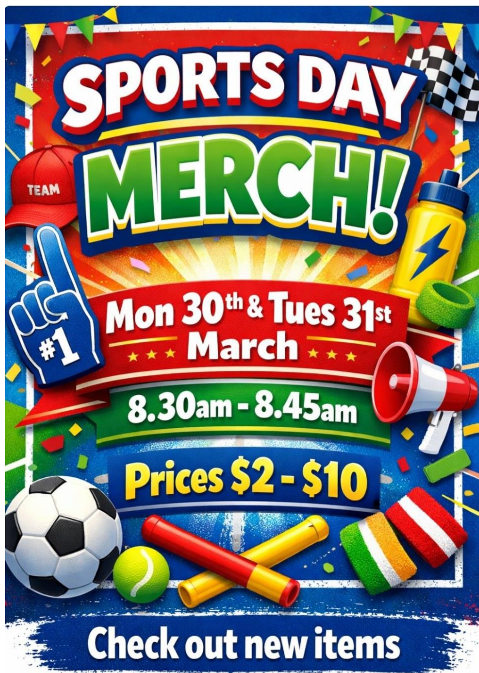
1 - Merchandise for Sports Day! Don't Miss it! See the image above for more details.