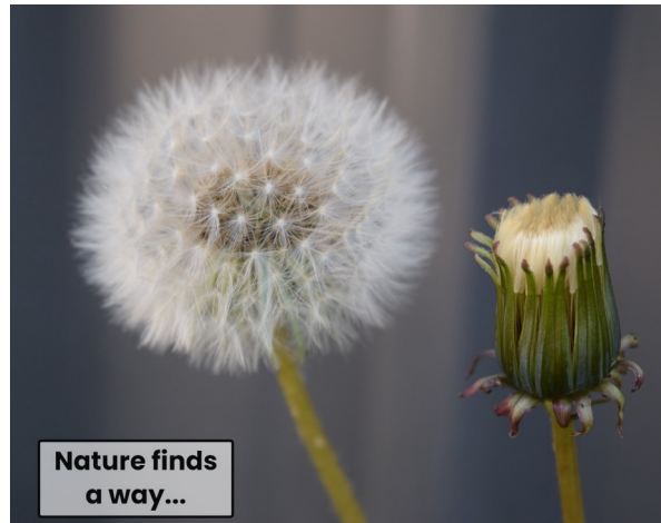
Blake S-H. (Yr 6)