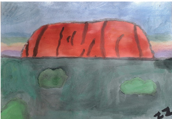
Zeke Z. (Yr 6.)