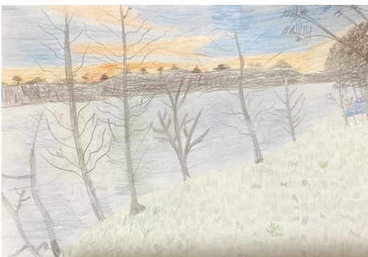
Chenu L—Year 5